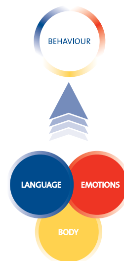
WAY OF BEING

Ontological Coaching is an extraordinarily powerful methodology for generating real change at the individual, team and organisational level. It is highly effective because it is based on a new practical understanding of the power of language, moods and conversations for sustainable behavioural and cultural change.